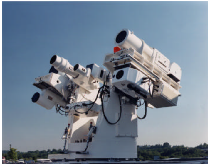
Brashear Kineto Tracking Mount

Inductosyn ® is a registered trademark of Ruhle Companies