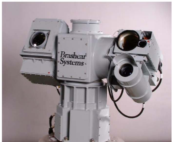
Lightweight Shipboard Electro-Optical System