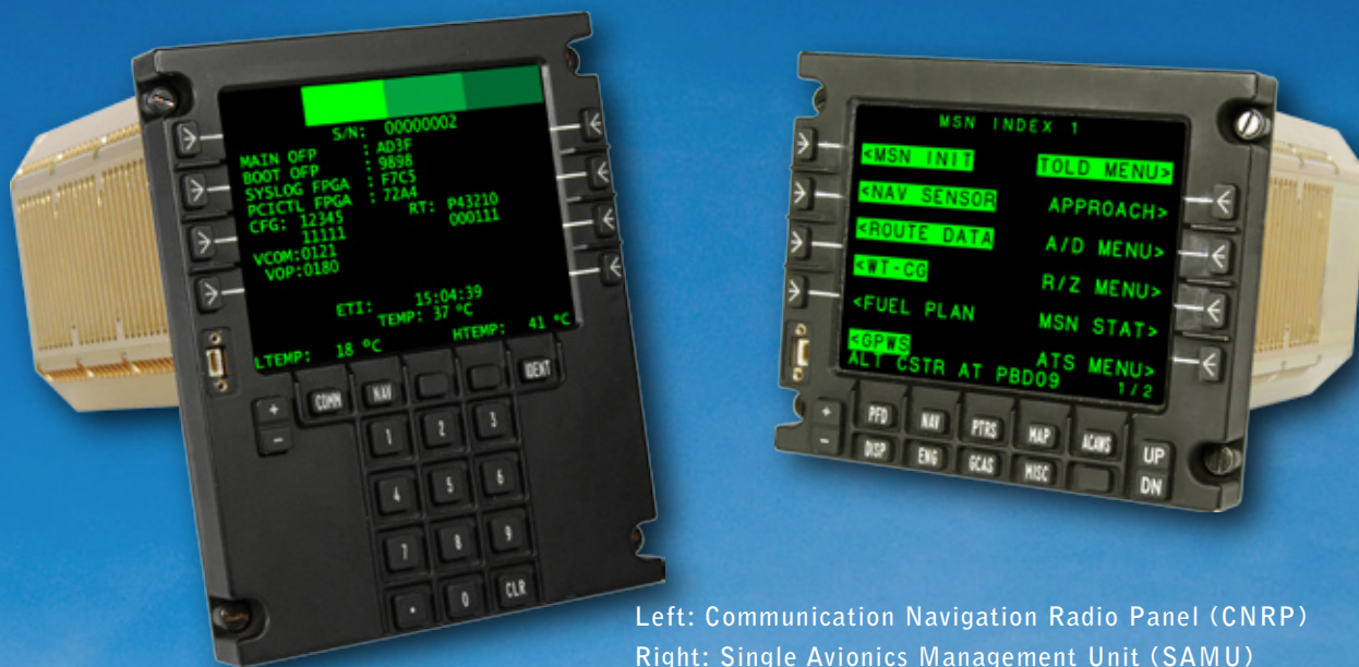
Left: Communication Navigation Radio Panel (CNRP) Right: Single Avionics Management Unit (SAMU)

The Actiview 500 5-inch viewable display, is part of the Superset™ Product Family of smart displays that utilize a modular common avionics concept and a "flashlight" approach for the display heads that allow over five (5) display sizes to be used with common, multi-interface avionic electronics hosting flexible modular software.