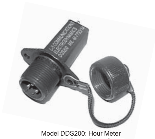
Model DDS200: Hour Meter Model DDS201: Event Counter

The time range for the DDS200 Hour Meter is 99999.99 hours. It has also been approved to MIL-M-7793/14. The DDS201 Event Counter has been successfully tested to the requirements of MIL-M-7793/14 and records counts when the unit receives power for greater than 5 seconds. Power-on times of less than 4 seconds will not cause the counter to increment. The count range is 9,999,999.