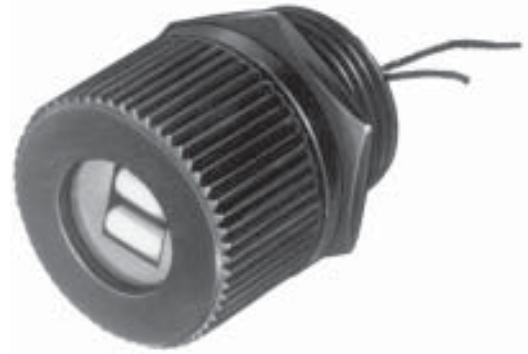
Model MI 51LP

* See page 27 for additional /4 qualified designs.