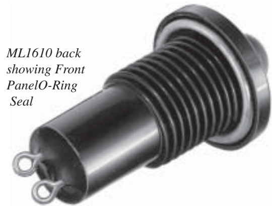
ML1610 back showing Front Panel O-Ring Seal