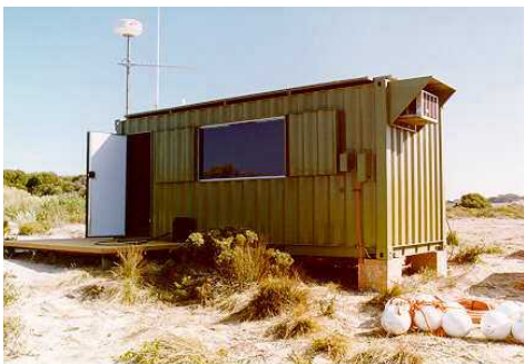
Example Range Centre

L-3 Nautronix's experience is that each of these systems is unique to the customer's requirements. Typically, research and development of a custom configuration is undertaken to meet the operational needs of the customer.