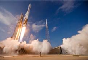
AEHF-1 Launch

August 14 , 2010 Cape Canaveral Air Force Station, Fla. — The U.S. Air Force successfully launched the first Advanced Extremely High Frequency (AEHF) communications satellite aboard an Atlas 5 rocket.