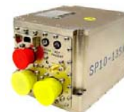
SP 10-135A Encryption Package

“The technology we’ve developed provides a vital capability to the telemetry systems being deployed.”