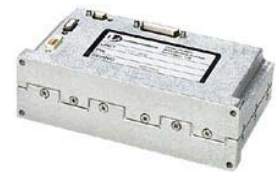
FTC-100 Flight Termination Receiver

The FTC-100 Receiver will be on display at the International Telemetry Conference in San Diego, CA, Oct 26-28. For more information, go to www.L-3com.com/TW .