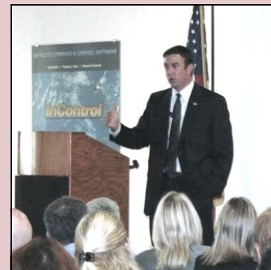
Congressman Duncan Hunter Speaks at L-3 TW