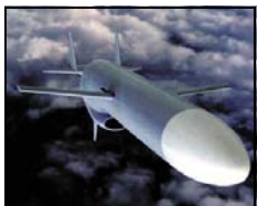
MALD ADM-160 Flight Vehicle