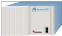
L-3 TW 550 Processor