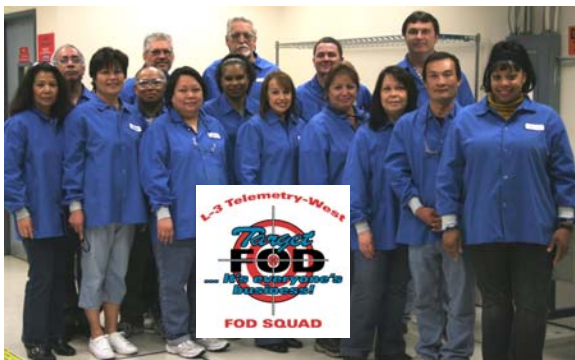
L-3 TW FOD SQUAD

He goes on to say, “Improving this aspect of our performance has been a critical step in building customer confidence in the quality and reliability of our products and services. Thanks to all who made this a huge success.”