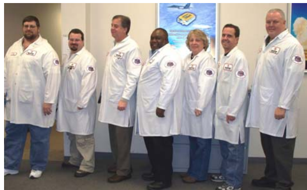
L-3 TE FOD ACTION TEAM