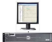
Vista Control Server