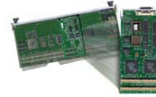
Now includes VME Mezzanine Carrier with Arbiter, 1,200-Watt Power Supply, and lower price!

The Base 550 System Chassis (PRO550C) is L-3's top-of-the-line system for real-time data acquisition, processing, storage, and distribution. This standard 10.5" 6U rack-mountable chassis includes a System Controller, a VME Mezzanine Carrier/Arbiter with 4 PMC slots, a 1,200-Watt power supply, and space for two disks and a cartridge tape for real-time data archiving. Its modular rear panel provides bulkhead connectors for up to 40 independent I/O functions.