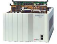
Add modules and chassis for flexibility and expandability.