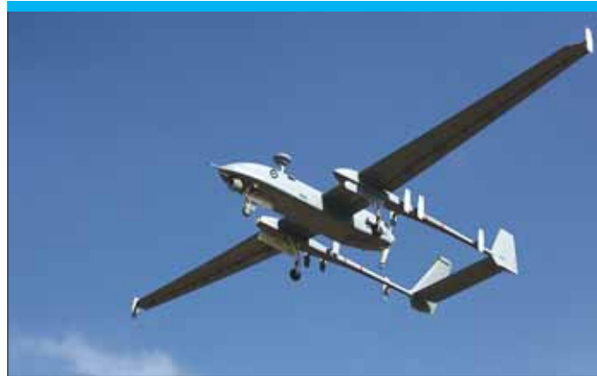
The first Australian leased Herons began operations in support of Australian troops in Afghanistan in December 2009.

In August 2009 Australian Army and Air Force personnel undertook training in Canada, and in September Australia signed an agreement with Canada under which those trained would be absorbed