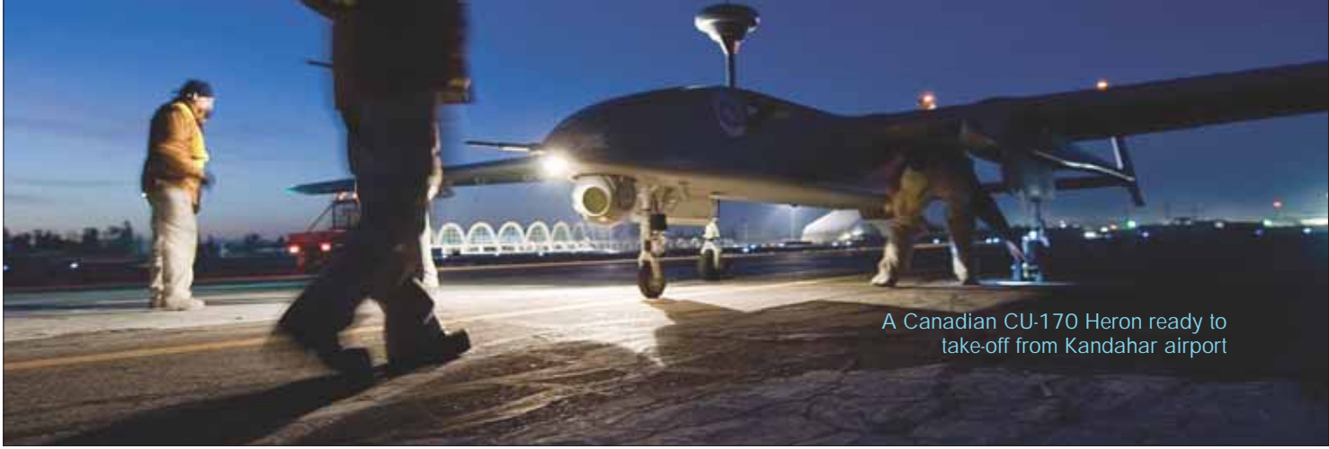
A Canadian CU-170 Heron ready to take-off from Kandahar airport

Intelligence: «The ability to learn or understand or to deal with new or trying situations» or «information concerning an enemy, or possible enemy, or an area», which of those two definitions better applies to the Afghan situation? The 'I' of the ISR is certainly the more difficult part of the business, as Surveillance and Reconnaissance are mostly a matter of assets.