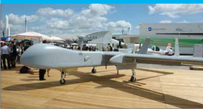
The French Air Force started to operate the Harfang in Afghanistan in February 2009. This system is based on the IAI Heron TP air vehicle with integration performed by EADS.

solution to the Bundeswehr. The German contingent already deploys the KZO and some smaller drones (see Drone Update, Armada 1/2010, page 26). The training of the first German Air Force crews was finalised in late January 2010. The first system, including three air vehicles, was to be deployed in March while the second will reach Afghanistan in May.