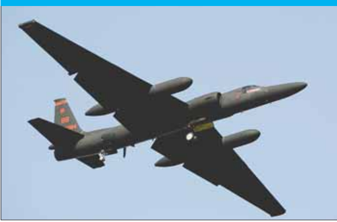
The U-2 'Dragon Lady' is part of the numerous aircraft deployed to the Persian Gulf to support American and Allied operations in Afghanistan.

By far, however, the major drone operator in Afghanistan remains the United States. The US Air Force alone increased its drone capacity by 300% in the past two years and is still deploying additional Predators and Reapers, reaching a total of 39 continual combat air patrols with one using an RQ-4 Global Hawk, and there is more to come. In April 2010 some Reapers should start flying with the new Gorgon Stare pod developed by Sierra Nevada, which includes twelve cameras, offering as many different views from a single aircraft – a num-