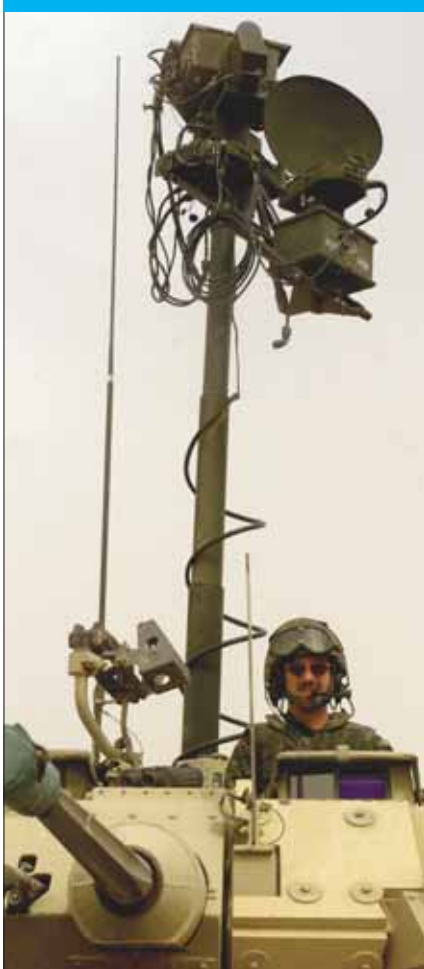
The mast-mounted radar of a Coyote armoured reconnaissance vehicle watches the perimeter of the Kandahar airfield. Those vehicles have proven to be valuable surveillance assets.

Any ground asset can be considered an intelligence-gathering platform – even the single soldier. However, vehicles such as the Canadian Army Coyote equipped with its full suite of sensors (including a radar), the German and Dutch Fenek, the Humvee equipped with Raytheon's Lras3, and many others, were specifically conceived for recce/surveillance roles. Complementing these, however, is ground electronic warfare equipment for the monitoring of insurgent communica-