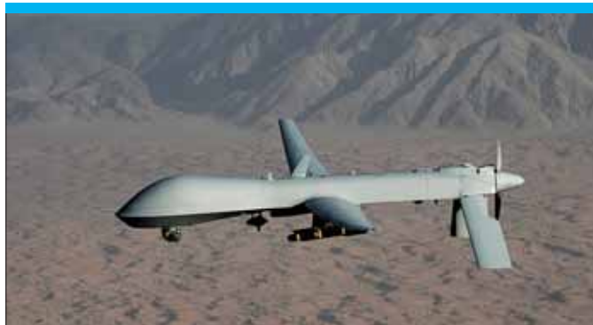
One of the most widely seen ISR assets in the Afghan skies is the MQ-1 Predator, different versions of which are in service with the American, British and Italian forces.

Although numerous countries deployed mini drones in the early period, the systems required to provide the required real-time data to the Isaf are male drones. These were deployed in the