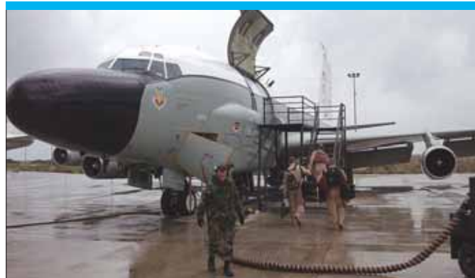
An RC-135 Rivet Joint aircraft ready for a mission. This electronic surveillance aircraft has seen extensive use in Afghanistan.

first deployed to Afghanistan in August the same year – a few months before the British MQ-9 Reapers flew their first missions (in October 2007). The latter were initially unarmed, thus mostly dedicated to recce missions, but they now fly with Hellfire P missiles and 226-kg GBU-12 laser guided bombs, thereby doubling as strike support assets. In October 2009 Britain fielded for the second time its highly autonomous BAE Systems Herti under an operational concept demonstration programme, possibly equipped with 'change detection' software.