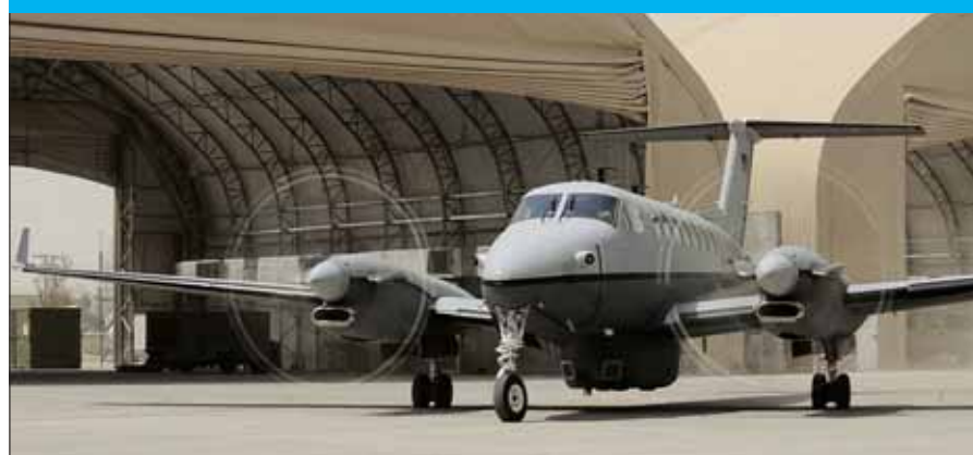
The first MC-12 Liberty aircraft in-theater taxis out of an aircraft hangar for its first combat sortie on 10 June 2009 at Joint Base Balad, Iraq.

three colour wide field-of-view CCD daylight cameras, a combined laser designator and rangefinder and a laser illuminator with auto-tracking capability. The service is acquiring 37 such aircraft as part of Project Liberty. Other aircraft equipped with