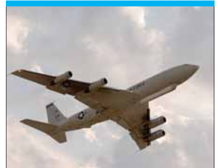
The Northrop Grumman E-8C Jstars is specialised in ISR missions and is deployed both in Afghanistan and Iraq.

When constant surveillance is required, tethered aerostats turn out to be one of the optimal solutions. Developed by Lockheed Martin, the Persistent Threat Detection System has been