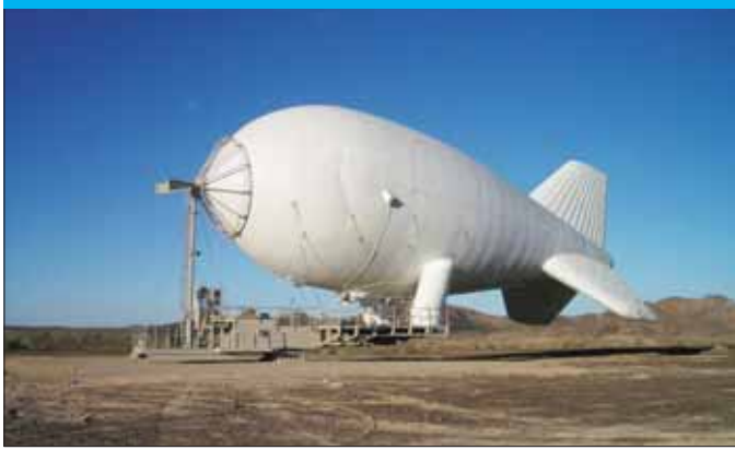
One of Lockheed Martin Persistent Threat Detection System (PTDS) blimps is constantly peering over the Afghan capital, monitoring all events with, inter alia , a belly-mounted L-3 Wescam MX-20 turret.