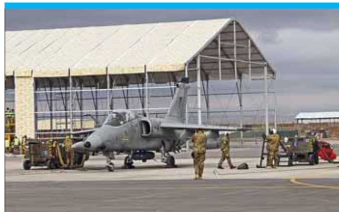
An Italian AMX equipped with a Reccelite pod. Fighter aircraft with reconnaissance capabilities complete the airborne imaging intelligence paraphernalia that operates in Afghanistan.

Imagery and intelligence gathering from the sky is not a drone prerogative, as numerous intelligence aircraft fly daily