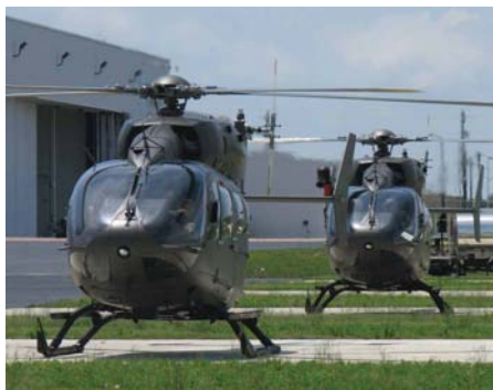
The first two Lakotas fielded by the ARNG land in Tupelo, Mississippi, in 2008.

Arriel 1E2) reliability, a maximum speed of 268km/h and endurance of up to 3.2 hours; capacity features such as a 500kg payload with gross weight of 3,500kg; and communications features such as the ARC-231 suite, interagency VHF/UHF comms and a cabin intercom system.