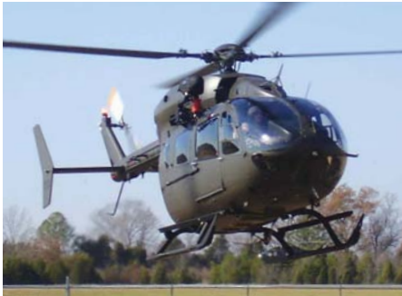
The arrival of the Lakota is freeing up Black Hawks to be deployed in support of operations in Iraq and Afghanistan.

US Military Academy (USMA) also operate the new aircraft.