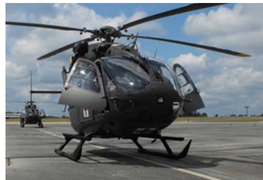
A UH-72A in medevac configuration after landing at its new home at Fort Polk, Louisiana, where it is replacing the UH-1 Iroquois.

'Here in the programme we have not only production but we also have the training of the pilots,' he explained. 'I've trained 360 pilots and 184 National Guard maintainers to date, and we continue to train pilots and maintenance personnel. So not only production but training